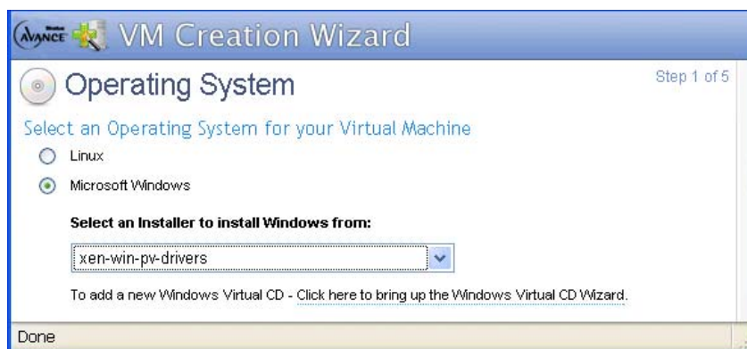
Figure 3: The Avance Virtualization Wizard: Built-in and Pre-configured

Prompting users through a few simple steps, the built-in Avance Virtualization Wizard makes it possible to create virtual machines in minutes.